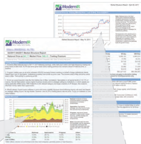
Rational to Market Price Comparison

With a summary of key elements of trading activity, graphs measuring trading behaviors and rational price, as well as other company-specific and market-related measures and trends, this report synthesizes market structure for management.